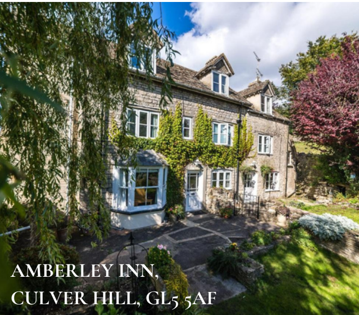
AMBERLEY INN, CULVER HILL, GL5 5AF