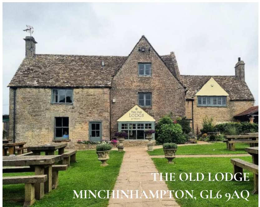
THE OLD LODGE MINCHINHAMPTON, GL6 9AQ