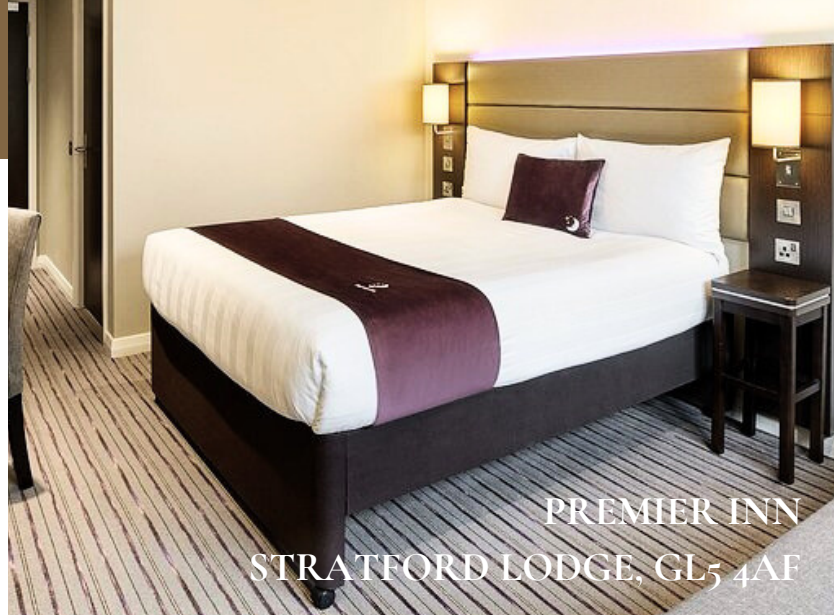
PREMIER INN STRATFORD LODGE, GL5 4AF