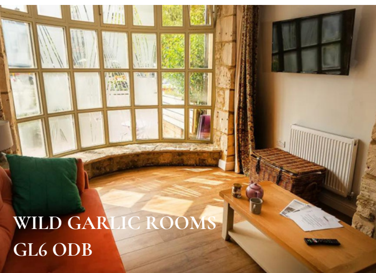
WILD GARLIC ROOMS GL6 ODB