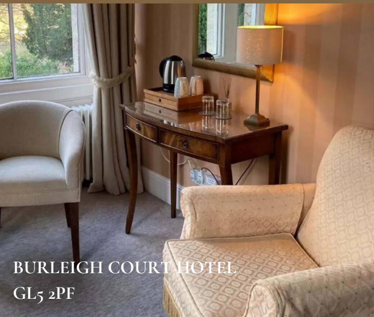
BURLEIGH COURT HOTEL GL5 2PF