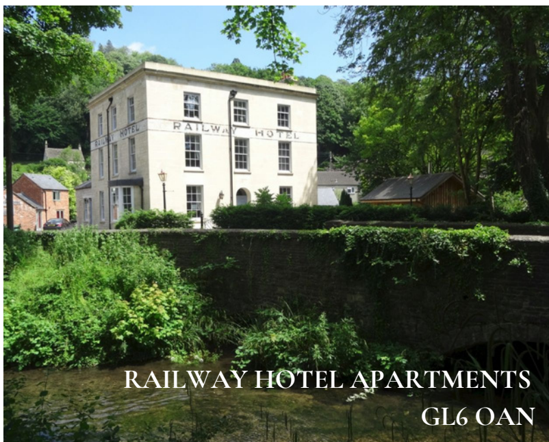
RAILWAY HOTEL APARTMENTS GL6 OAN